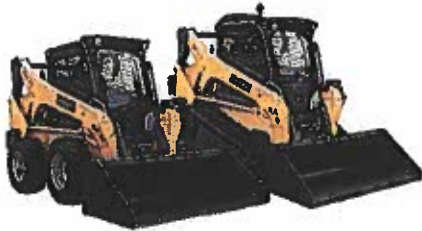
4 Models of Skid Steer & Track Loaders