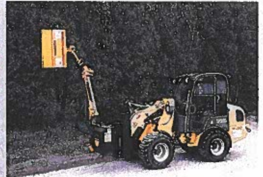
Compact Loaders 7,000lbs - 13,000lbs Articulating & All Wheel Steer Models