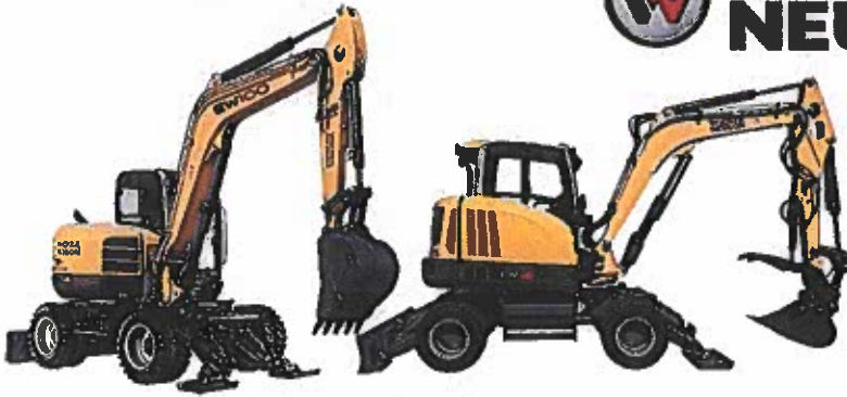
Rubber Tired Excavators 12,500lbs - 21,500lbs