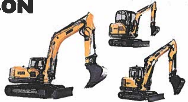
Compact Excavators 2,400lbs - 34,000lbs