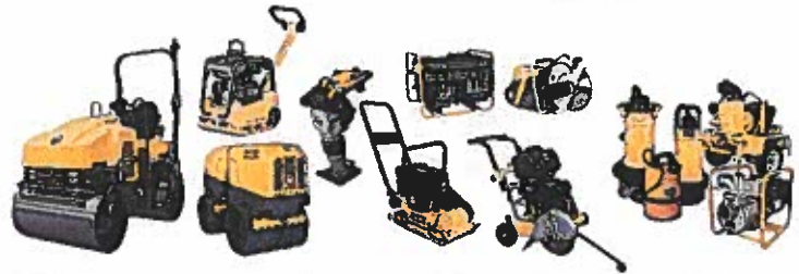
Rollers, Compactors, Rammers, Saws, Generators & Pumps