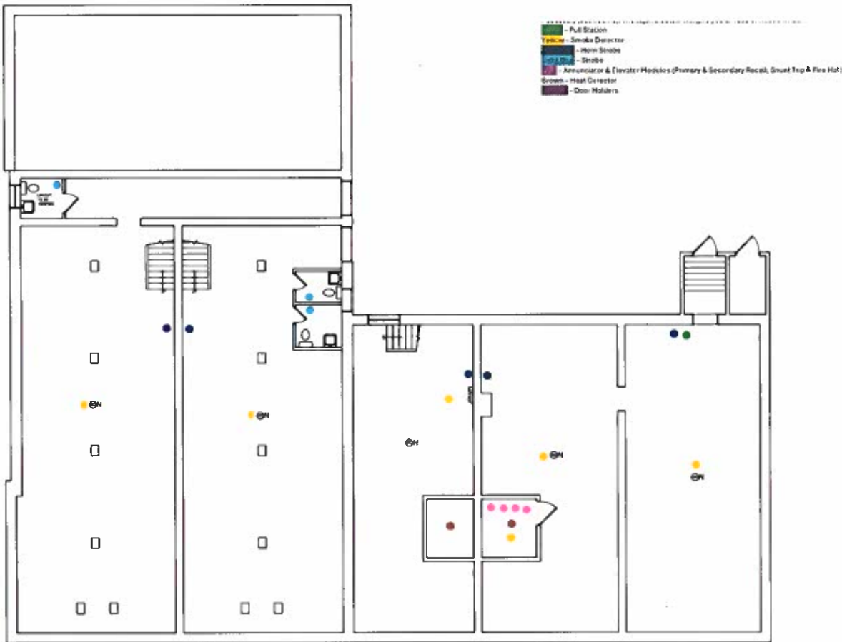
BASEMENT PLAN SCALE: 1/4" = 1'-0" 1/4" = 1'-0"